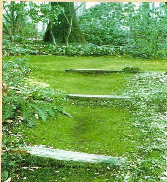
A fern moss path eliminates erosion

of moss offered has been phenomenal. Several large Japanese Gardens, as well as thousands of other shade garden projects have been successfully covered in luxurious blankets of moss.