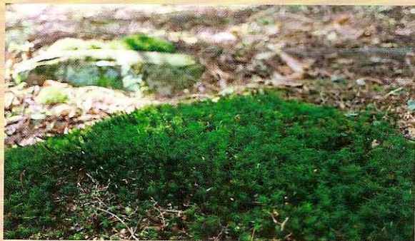
Haircap Moss (Polytrichum)

This knowledge is now being passed on through Moss Acres in the form of direct shipments of the highest quality mosses, detailed planting instructions, a video, and guide booklet.