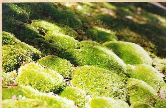
Cusion Moss - “Leucobryum”