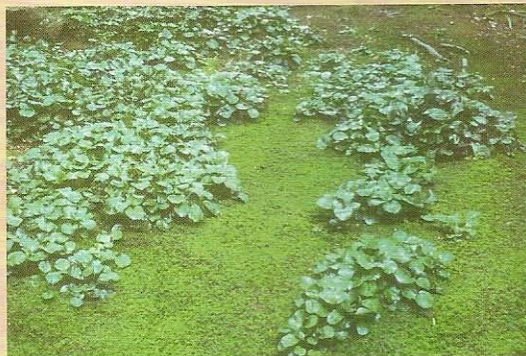
Fern Moss & Shortia